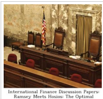
International Finance Discussion Papers Ramsey Meets Hosios: The Optimal Capital Tax and Labor Market Efficiency