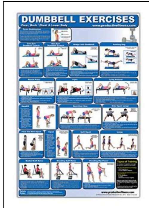
Filesize: 1.47 MB