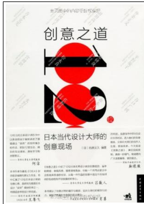
Filesize: 2.74 MB