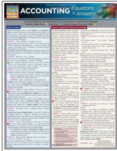
Filesize: 6.2 MB