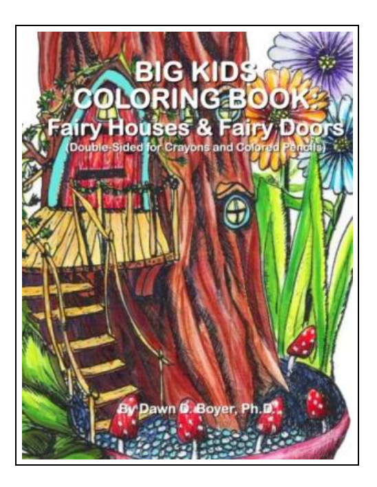
Filesize: 3.88 MB