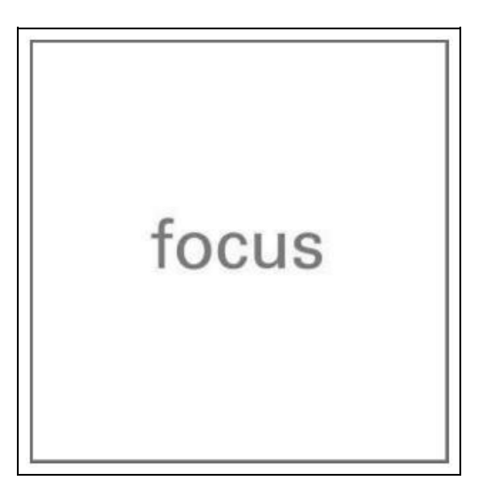
Filesize: 5.57 MB