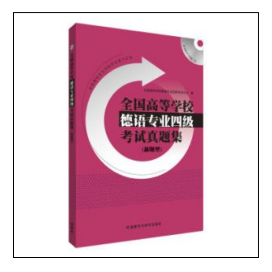
Filesize: 5.44 MB