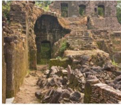
IN TRANSIT, VOLUME 11, ISSUE 5...