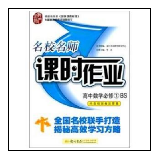
Filesize: 6.37 MB