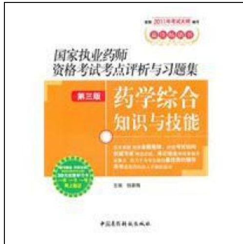
Filesize: 8.78 MB