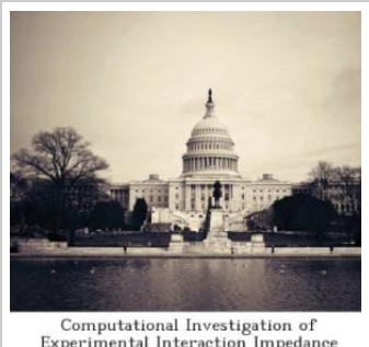
Computational Investigation of Experimental Interaction Impedance Obtained by Perturbation for Helical Traveling-Wave Tube Structures