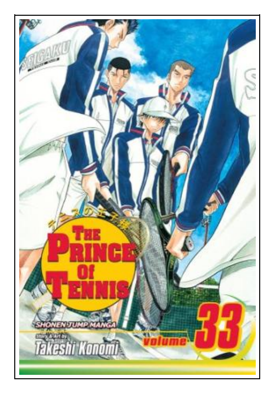
Filesize: 6.51 MB