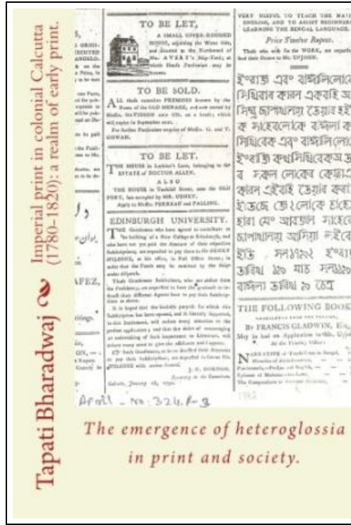
Filesize: 7.29 MB