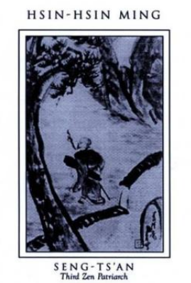
Third Zen Patriarch