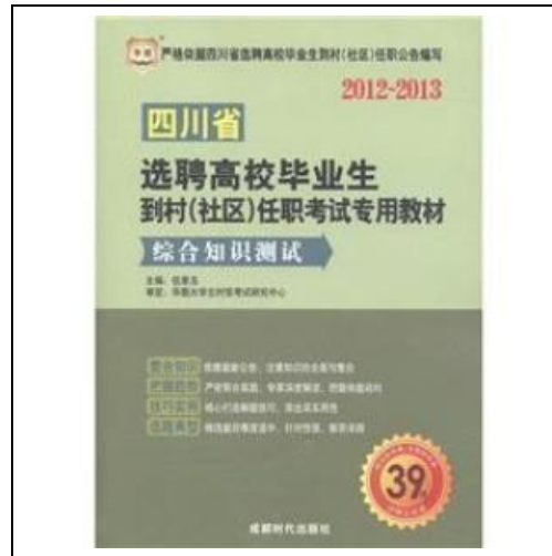
Figure 2012-2013 Sichuan Province. hiring college graduates to the village (community) in China as an examination of special materials: knowledge test (with a 39 yuan learning vouchers) [Paperback]