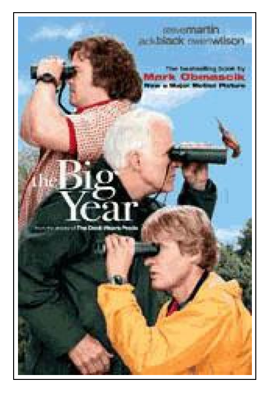
Filesize: 8.65 MB