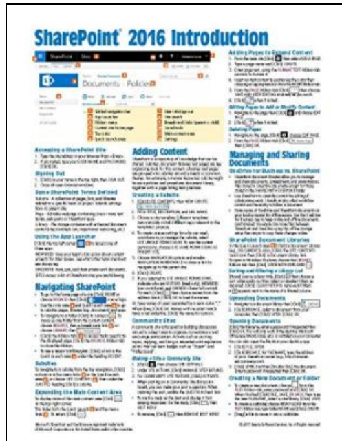
Filesize: 1.5 MB