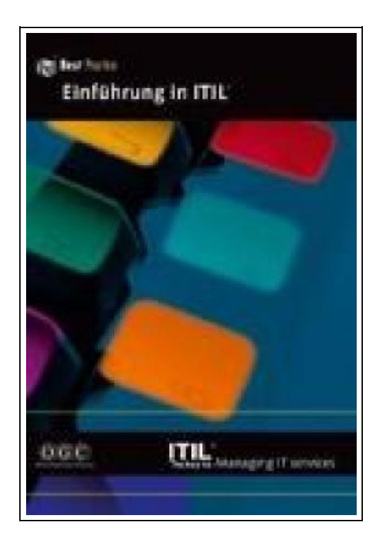
Filesize: 6.05 MB