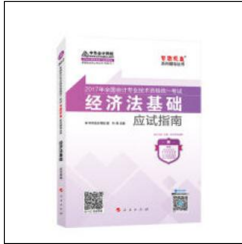
Filesize: 9.72 MB