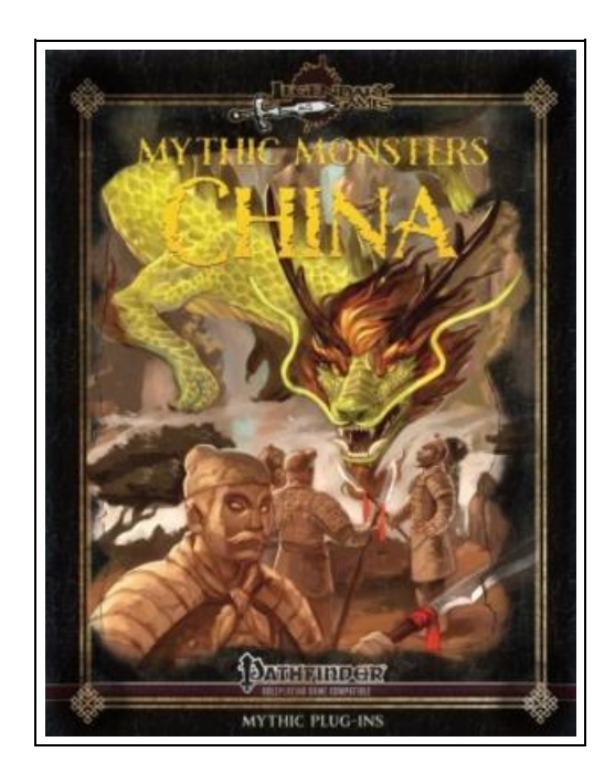
Filesize: 6.45 MB