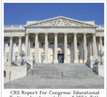
CRS Report for Congress: Educational Testing: Implementation of ESEA Title I-A Requirements Under the No Child Left Behind Act

Congressional Research Service: The Library of Congress, Wayne C. Riddle