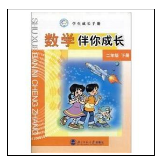
Filesize: 4.38 MB