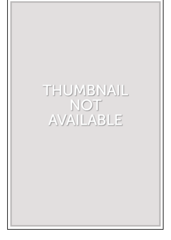
Filesize: 2.19 MB