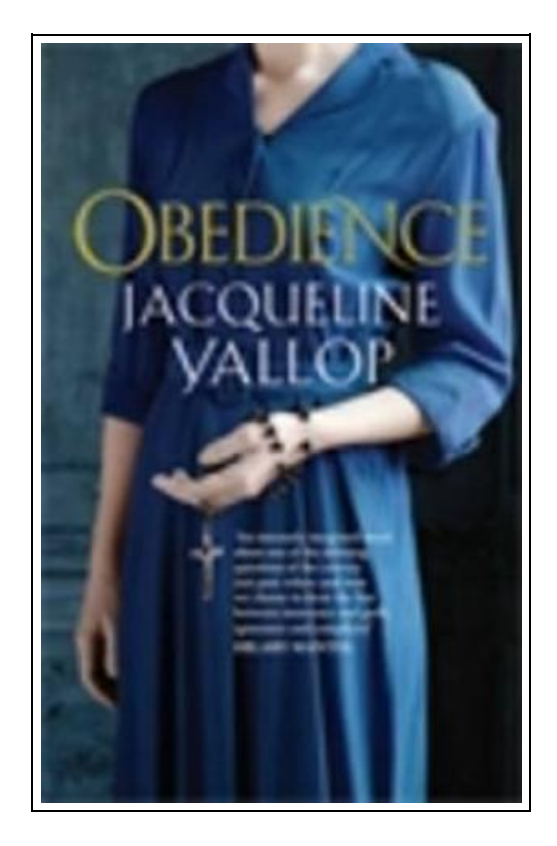
Filesize: 4.07 MB